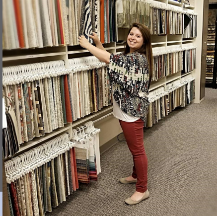
Industry Standard Training